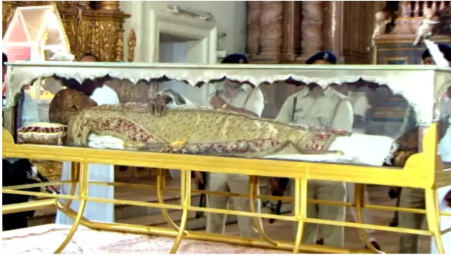
Event set to attract millions as state allocates Rs 300 crore for the historic 45-day showcase

Goa is gearing up for a significant spiritual event as the XVIII Exposition of the Sacred Relics of St. Francis Xavier is scheduled to take place from November 21, 2024, to January 5, 2025. This rare occasion, held every ten years, is expected to draw millions of pilgrims and tourists to the Basilica of Bom Jesus in Old Goa, where the saint's mortal remains are enshrined. The state government, led by Chief Minister Pramod Sawant, has announced a budget allocation of Rs 300 crore from the central government to ensure the successful execution of this grand event. The